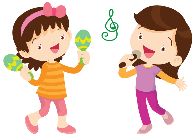
4: Doing something we enjoy