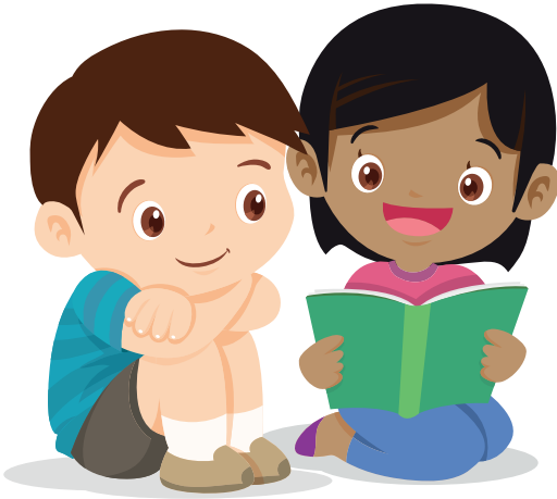
1: Playing with our friends

People feel happy for lots of different reasons and we can all feel happy about different things. Here are some examples of when we might feel happy: