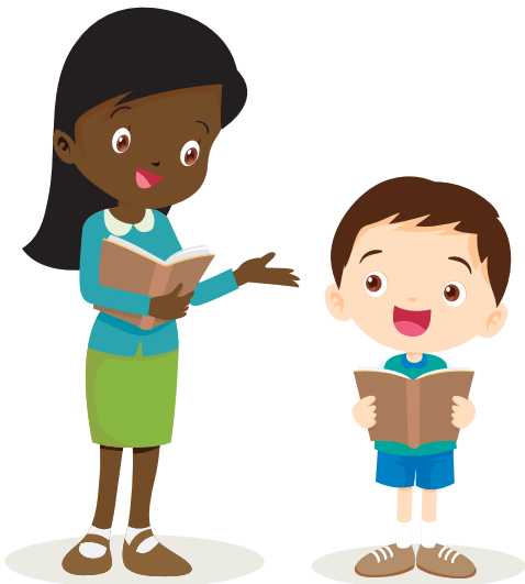
3: Getting praise