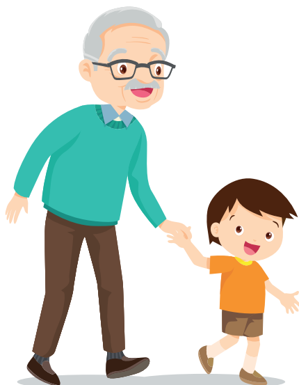
5: Spending time with family, loved ones and pets

REMEMBER: By being kind to people we can help people to feel happy.