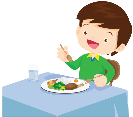
2: Having a favourite food or treat