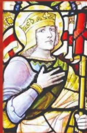
St George, pray for us

Loving God, Pour out your Spirit on our college. Let us be filled with your grace. Let us put on your armour to face the world with courage. Let us aspire to become all you have created us to be. We ask this in the name of Jesus, our Redeemer. Amen.